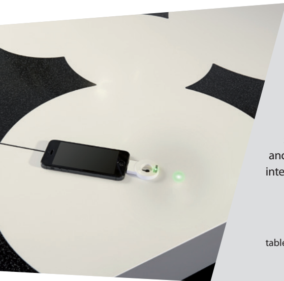
Table top from the “Corian® 2.0” exhibition (Milan, April 2014) incorporating wireless recharging for smart devices; table design by Christian Ghion; photo Leo Torri for DuPont™ Corian®; all rights reserved on design and image.

Corian® looks forward to an exciting future, not only through its valuable longevity but also in ever evolving technology. Always a few steps ahead, Corian® is now available with integral wireless recharging power for smart devices. This is a material with the needs of today and tomorrow very much in mind, from the embedding of interactive systems to its ability to be reused – and the zero impact it makes on landfill during its manufacture.