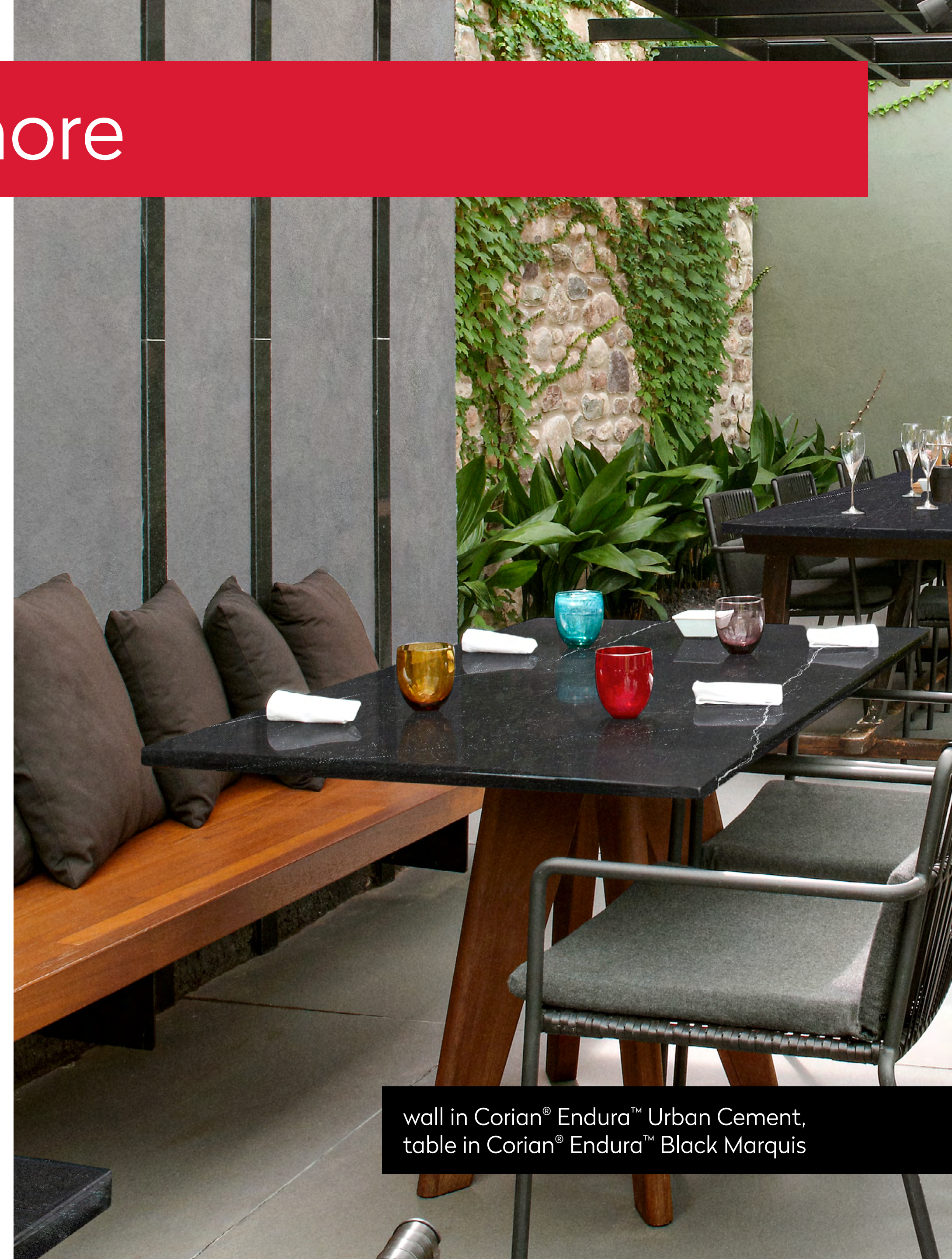
wall in Corian® Endura™ Urban Cement, table in Corian® Endura™ Black Marquis

The high heat resistance of Corian® Endura™ makes it an ideal medium for integrated cooking as well as built-fire pits.