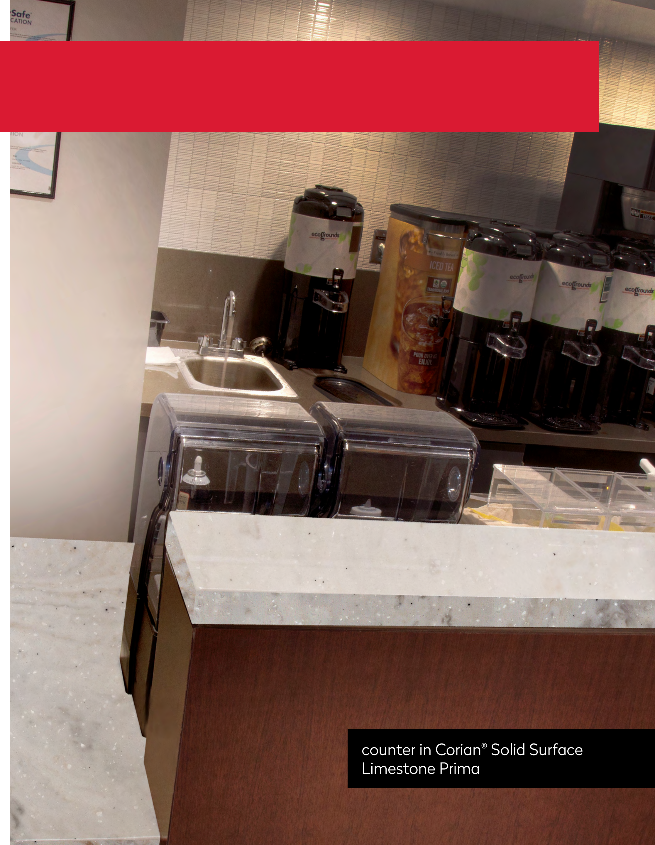
counter in Corian® Solid Surface Limestone Prima

Corian® Design Surfaces also enable easy, frequent and quick cleaning.