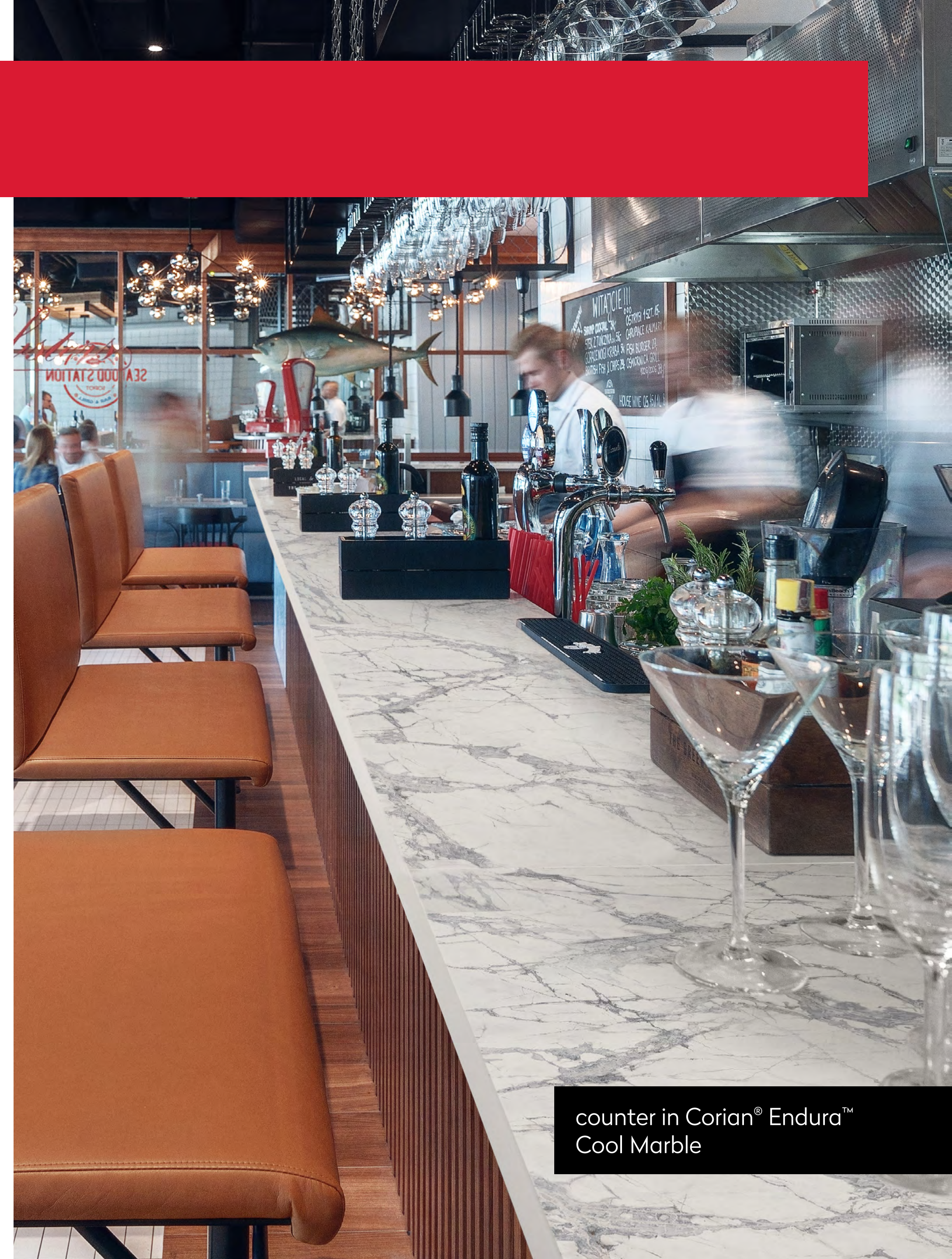
counter in Corian® Endura™ Cool Marble