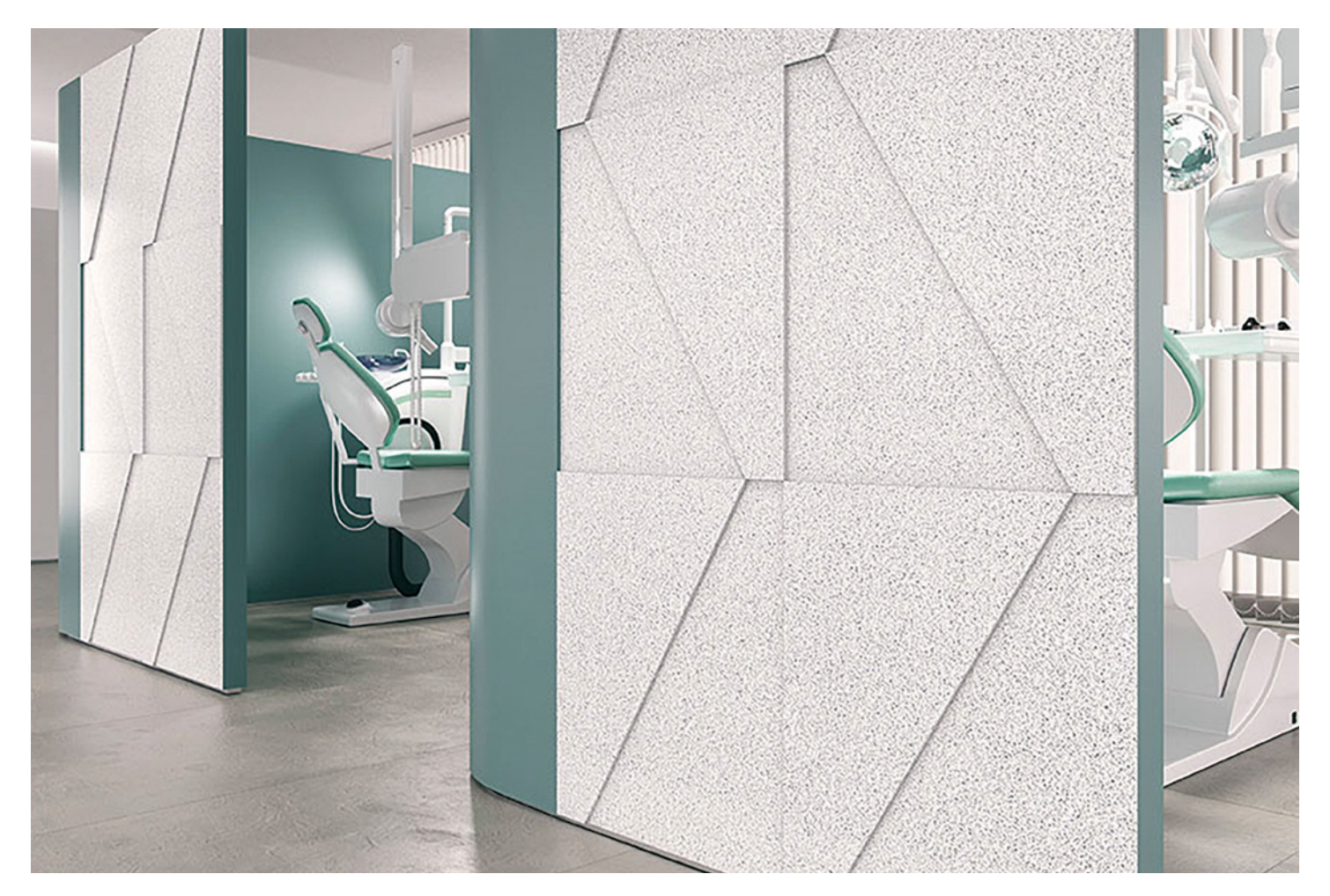
CORIAN® SOLID SURFACE CARRARA LINO

Corian® Solid Surface places design, durability and hygiene at the heart of every healthcare space. Through stunning and thermoformable aesthetics, Corian® Solid Surface enables you to take design in unique directions with superior performance benefits.